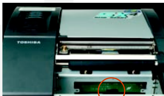
▲ UHF RFID antenna